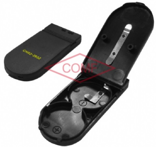
CH02-2032AS Shown without leads