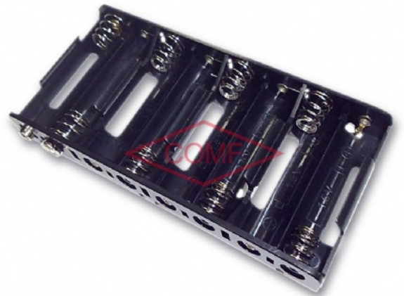
BH-381-3B Shown With Snap Terminals