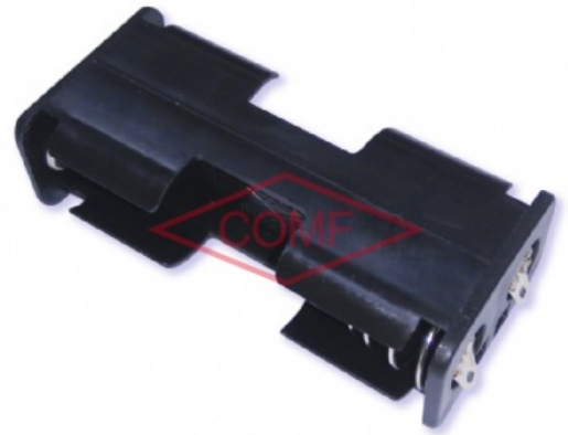
BH-322-2D Shown With Solder Terminals