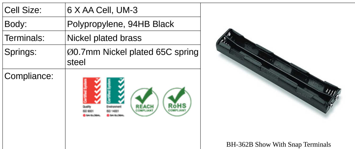
BH-362B Show With Snap Terminals